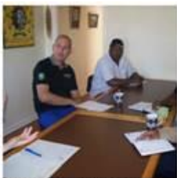
Calabash Tours team workshop

11 March - Meeting with the team at Emmanuel Project, a HIV care initiative Calabash supports: