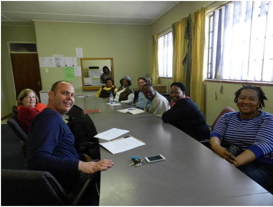
A weekly meeting at A V Bukani School