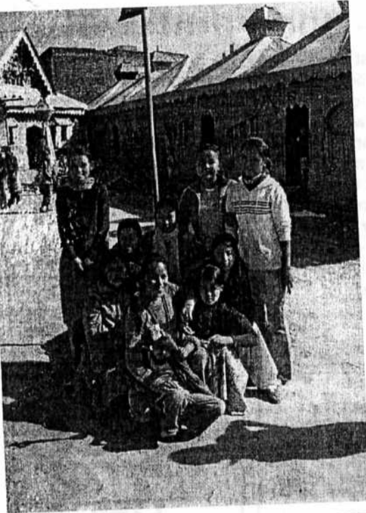
Girls from Grade Nine taking a break from studies