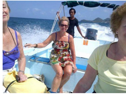
weekend trip to Marigot Bay with co-volunteers

Please note – this report is supplied by a former volunteer and the contents are intended solely for your information and personal use. people and places has permission to publish this information to you as a future volunteer. Please check with us if you would like to publish it beyond your own circle of friends and family. Thank you.