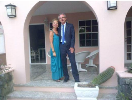
Our pad in Saint Lucia