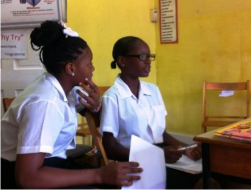
role play – interview skills