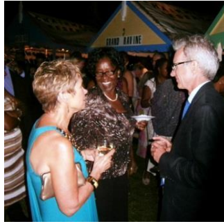
chatting with the Governor General