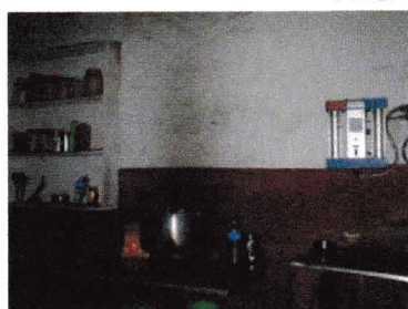
Kitchen/ Cooking room