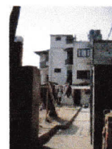
2 nd building at Naxal Kitchen & dining and infant & girls rooms