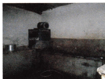
Kitchen/Washing up room