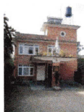
1 st building at Naxal Offices & boys quarters

The children's home is run by a NGO non-profit making charity that was set up in 1999 by a group of Nepalese businessmen. It takes care of 40-50 children aged birth to 16 years who are orphaned, abandoned or displaced