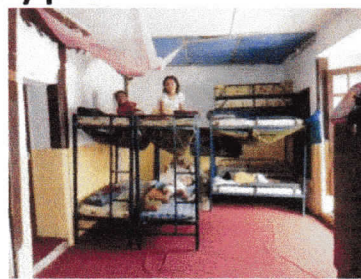
Girl's dorm- blue plastic on ceiling