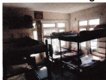
Boy's dorm 11'x11' - 4 bunk beds