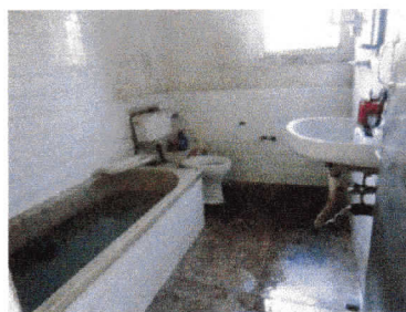
Boy's bathroom-blocked bath waste!