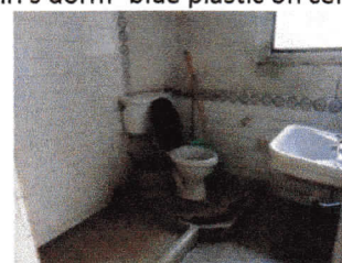
Shower room next to office Girl's use this as there is no bathroom in their building

I have volunteered at OCCED Nepal Children's Home at Naxal three times. The first time was in 2008 through http://www.travel-peopleandplaces.co.uk/ , and returned in 2010 & 2011, each time seeing the worsening state of the living conditions despite the efforts of the organisation & volunteers who have given time & money to decorate & refurbish as best they can.