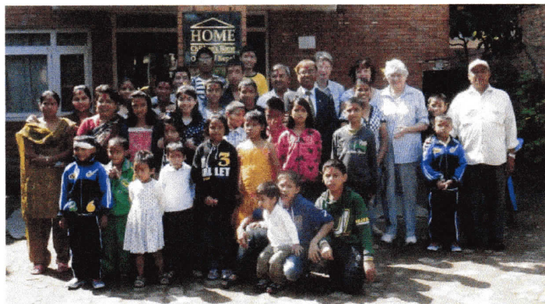
Organisation for Community Child & Environment Development

Can you help the charity who takes care of these children build it?